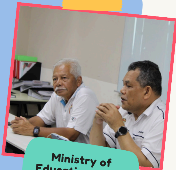
Ministry of Education Visit:

We are glad to have had the opportunity to host such a meaningful event and look forward to implementing the feedback received to continue fostering a positive learning environment.